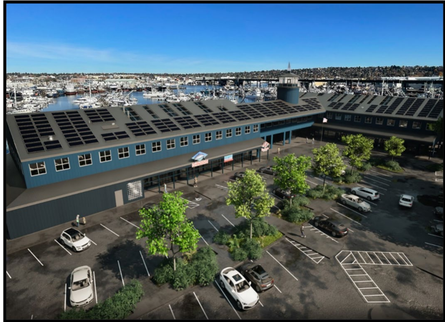
Architectural Rendering of C15 with Solar Panels and New Facade